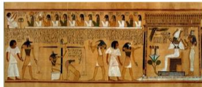
This tomb painting shows the journey to the afterlife. The god Anubis weighs the dead person's heart to find out if they have been good in life. Good people can enter the afterlife but bad ones get eaten by a demon goddess!